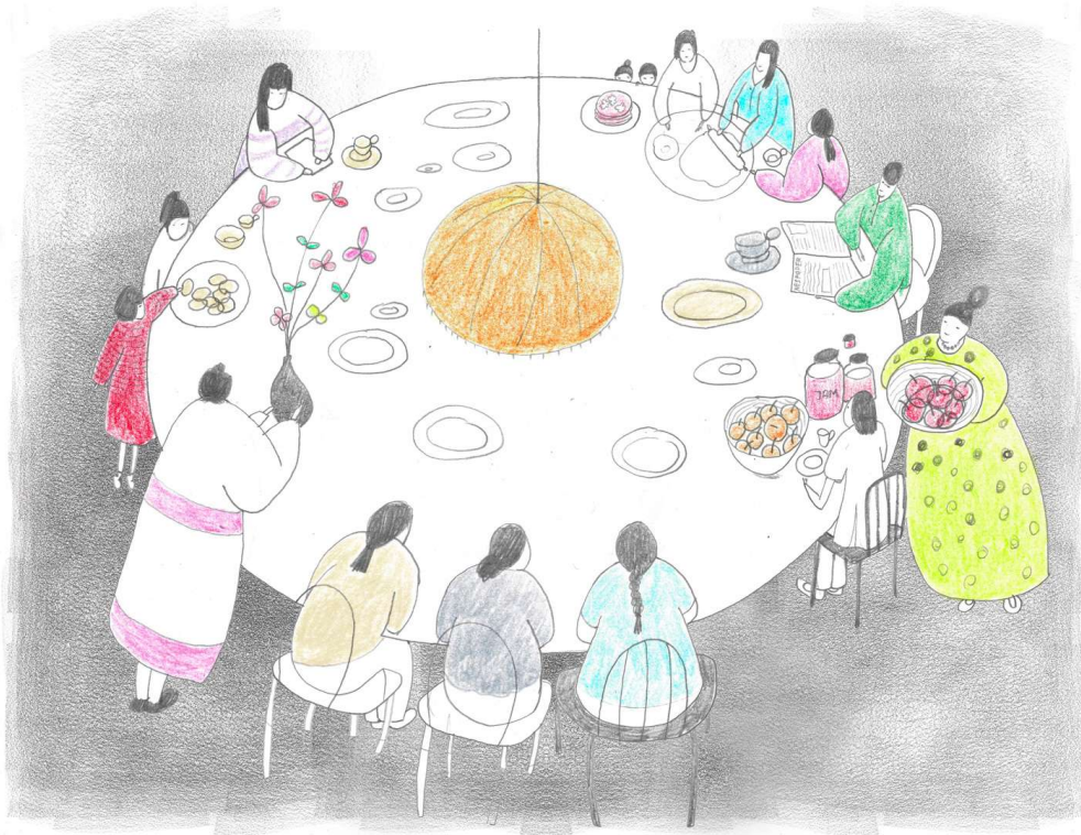
Collaboration, People, Ecosystem