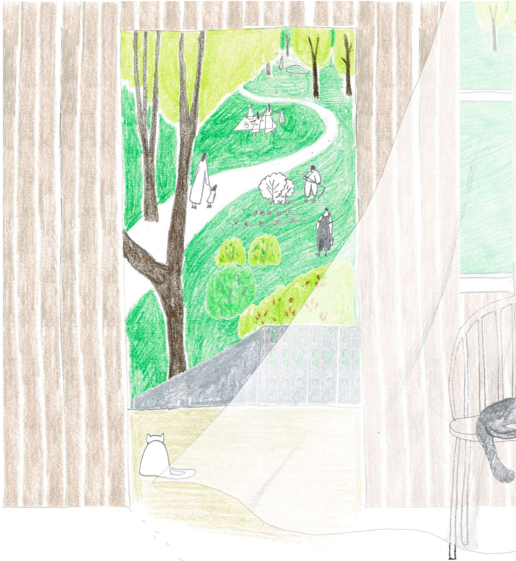
Free Circulation and Access